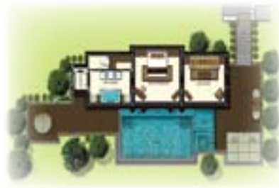
Estimated Floor Area 130 sqm – 155 sqm All plans are not drawn to scale