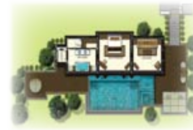
Estimated Floor Area 130 sqm – 155 sqm All plans are not drawn to scale