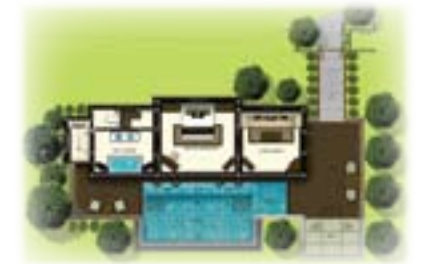
Estimated Floor Area 130 sqm All plans are not drawn to scale

A stretch of the silky-white sand, inviting turquoise waters, and a salt-tinged breeze greet you as you step outside your Beachfront Pool Villa. During the day, bask on the shore or frolic in the waters of the private bay and when dusk settles, withdraw into your lavish villa to savour a candle-lit dinner for two. All six of these beachfront pool villas have close access to the beach.