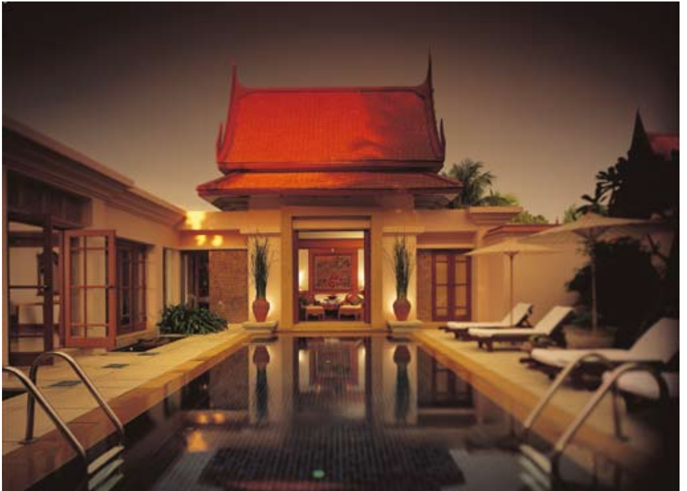
Two-Bedroom Pool Villa