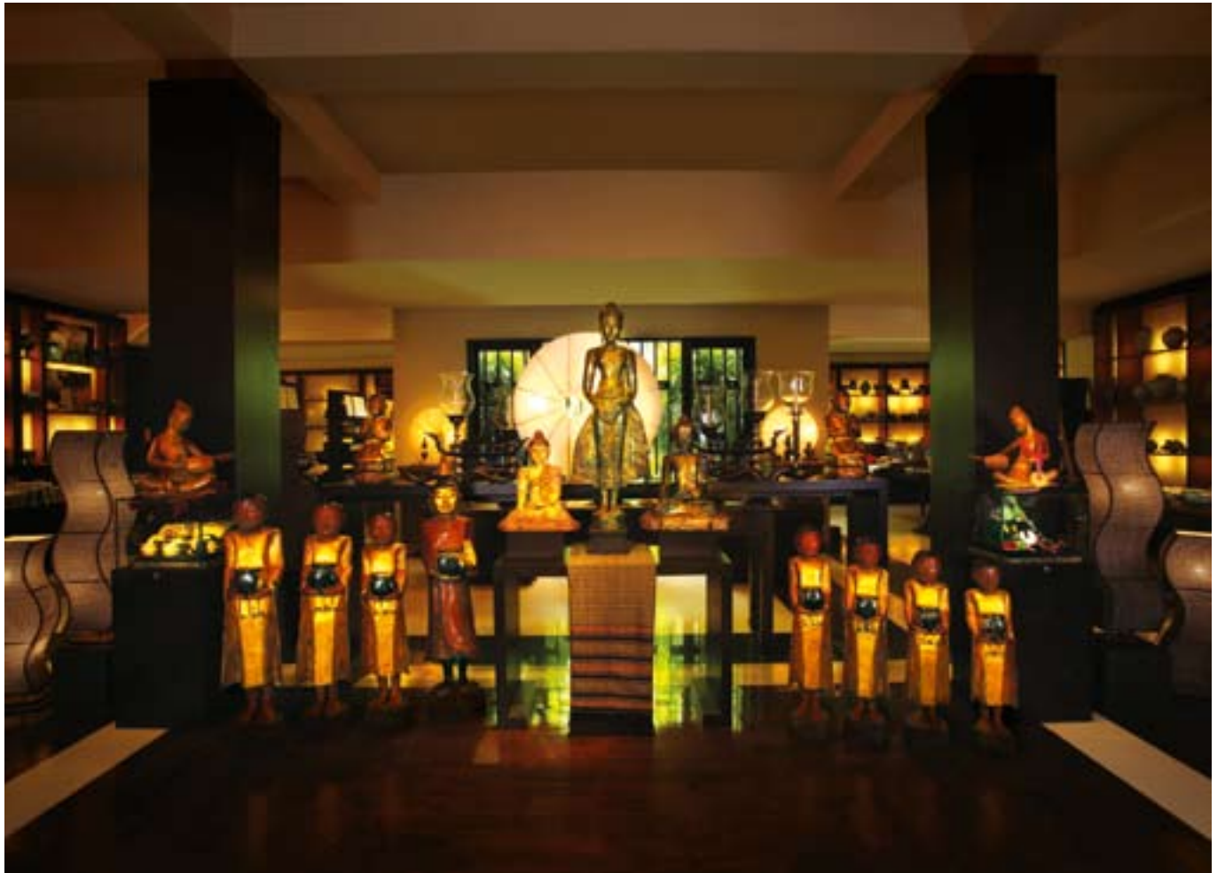
Banyan Tree Gallery