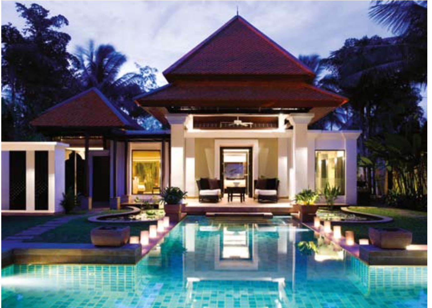
Spa Pool Villa